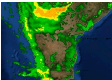
Current best model