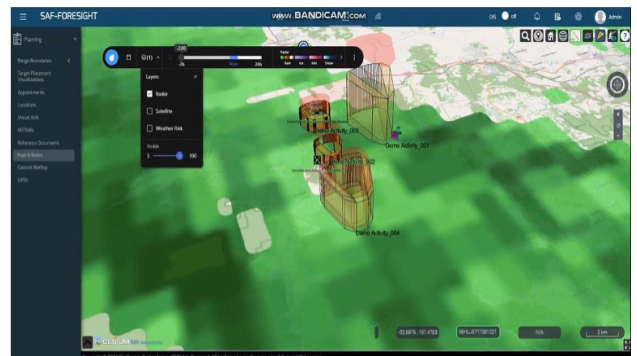
Weatherverse Planner plug-in UI example