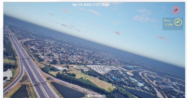
Weathervers Sim example

Discover how you can leverage weather data from the world's most accurate forecaster and the comprehensive, feature-rich Weathervers portfolio to improve mission outcomes. Contact us today at weathercompany.com/contact/defense to learn more about the Weathervers portfolio.